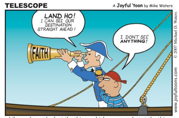
while we do not look at the things which are seen, but at the things which are not seen. For the things which are seen are temporary, but the things which are not seen are eternal. – II CORINTHIANS 4:18 NKJV

July 7 Petting Zoo/Alligator Farm 9 am—2:20 pm July 11 Cabot Aquatic Park 11:30 am—3:30 pm July 18 Zoo (TBD) TBD July 25 Big Rock Mini Golf 9:30 am—2:30 pm